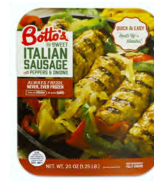
Italian Charbroiled Sausage with Peppers & Onions in Tray (X) 20 oz – XX lbs

Italian Charbroiled Beef & Veal Meatballs in Tray (X) 16 oz – XX lbs