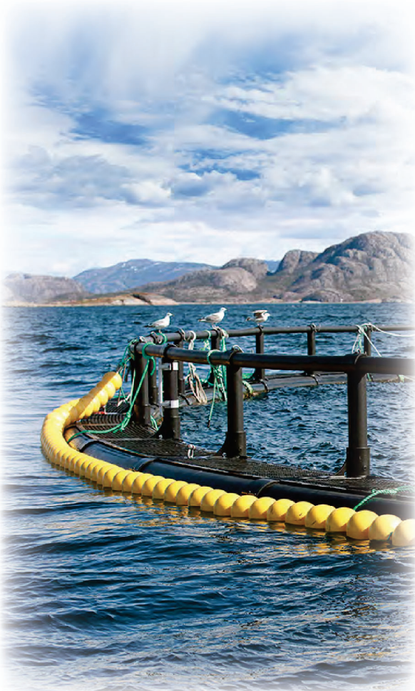
Marine Raised in their natural open environment.

Our Faroe Islands Salmon comes straight from the Faroe Islands, nestled between Norway and Iceland in the pristine waters of the North Atlantic. This small group of remote islands promote the perfect natural conditions for the world's finest farm-raised Salmon.